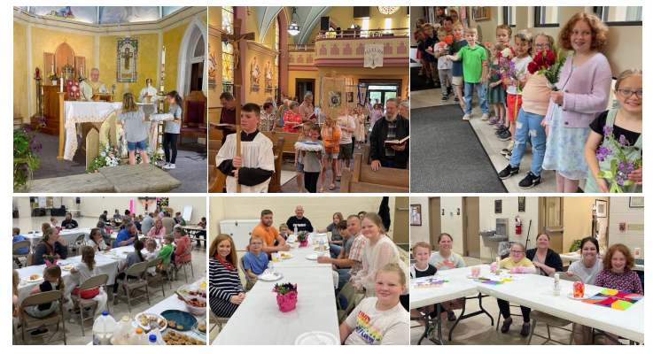
St. Mary - Hillsboro - May Crowning, PSR Family Breakfast, PSR Retreat